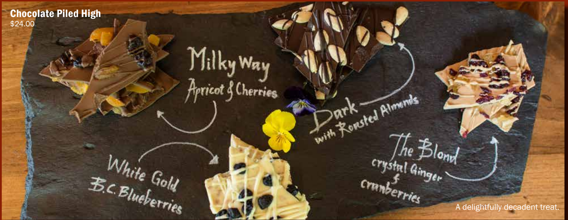
A delightfully decadent treat.