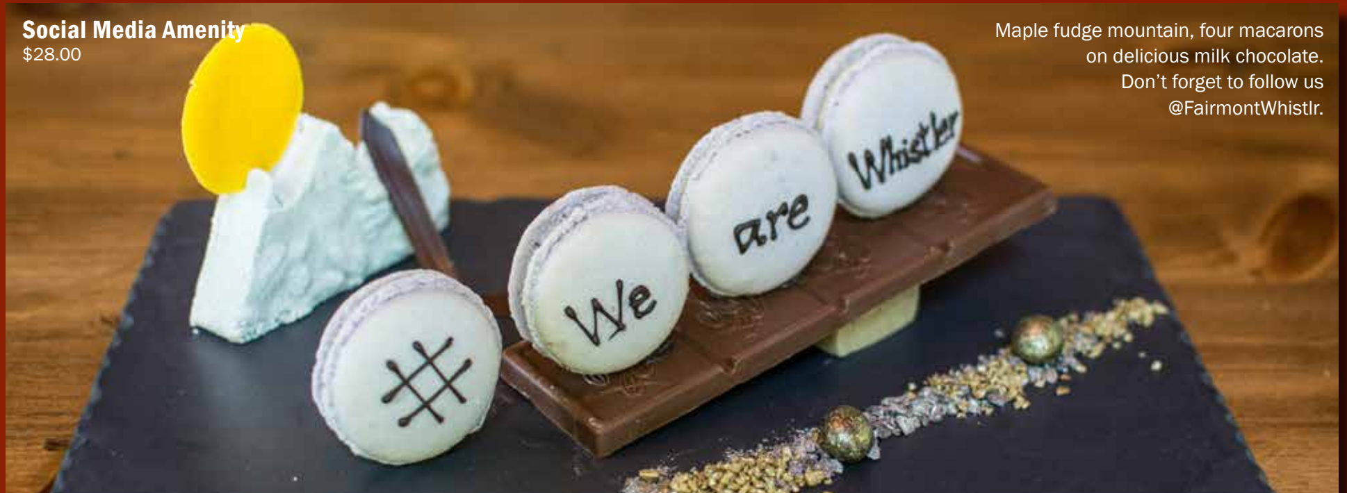
Maple fudge mountain, four macarons on delicious milk chocolate. Don't forget to follow us @FairmontWhistlr.