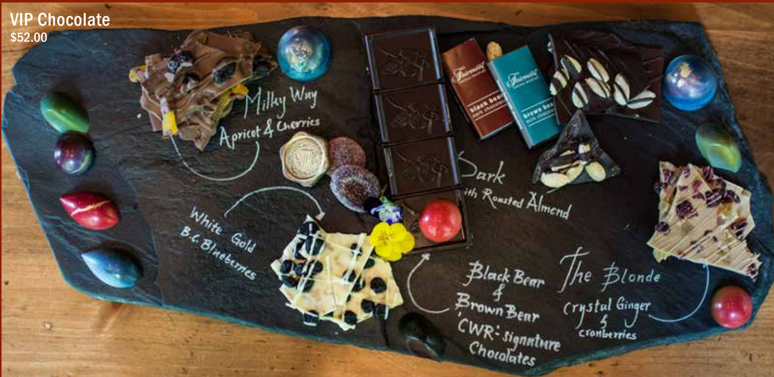
VIP Chocolate $52.00

Our Chefs have put their sweetest thoughts into creating these handmade delicacies. Chocolate lover or not, they are impossible to resist!