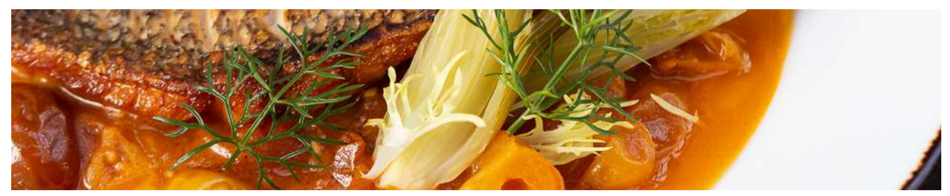
All prices are in USD and subject to 26% service fee and 10% tax. Menu items may contain nuts & nut by-products. Please advise your Event Services Manager of any allergies.