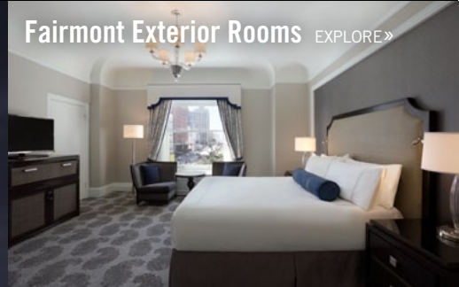
Fairmont Exterior Rooms EXPLORE >>