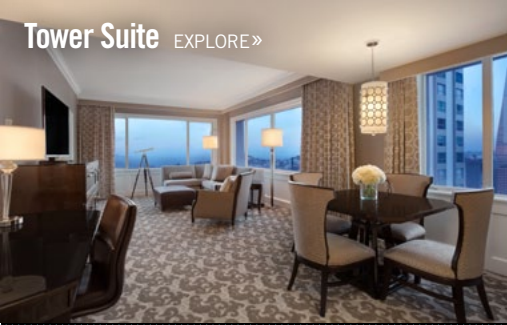
Tower Suite EXPLORE >>