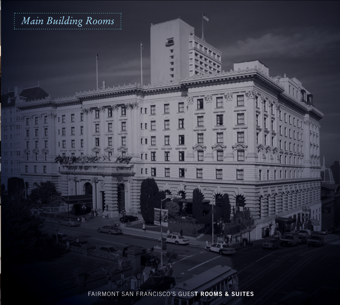
Main Building Rooms