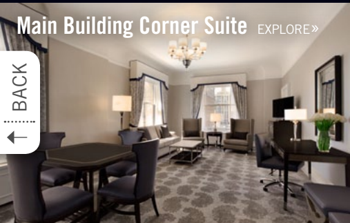
Main Building Corner Suite EXPLORE >>