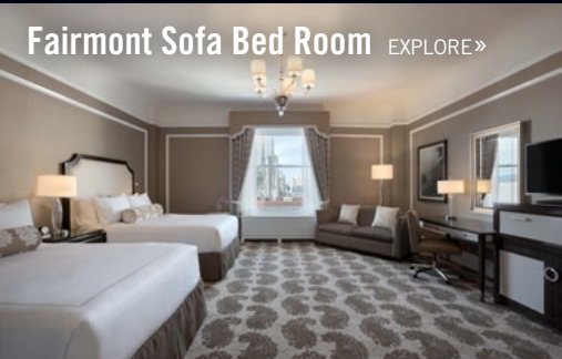
Fairmont Sofa Bed Room EXPLORE >>