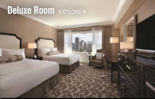
Deluxe Room EXPLORE >>