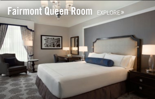
Fairmont Queen Room EXPLORE >>