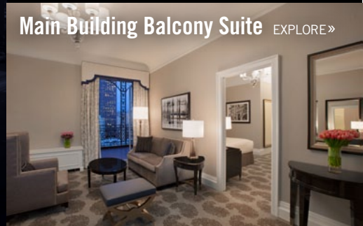
Main Building Balcony Suite EXPLORE >>