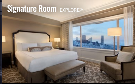
Signature Room EXPLORE >>