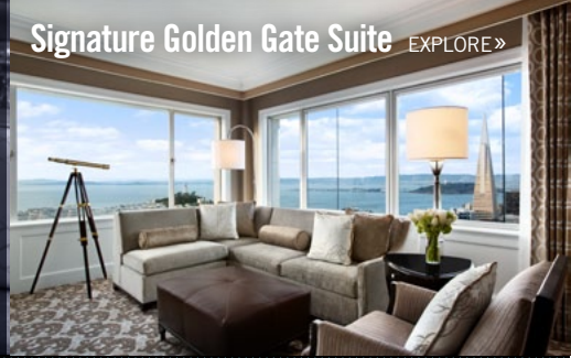
Signature Golden Gate Suite EXPLORE >>