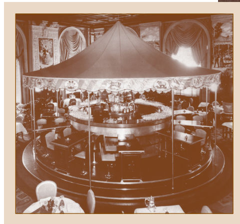
In the 1930s, patrons celebrated Prohibition's end with a flourish in the Merry-Go-Round Bar, which has since been transformed into the Oak Bar.

Today, with the completion of a multimillion dollar restoration, the Fairmont Copley Plaza shines brighter than ever. The hotel celebrates its connection to the city with eight culturally themed suites that celebrate the history of Boston. The Fairmont Copley Plaza is truly part of the community.