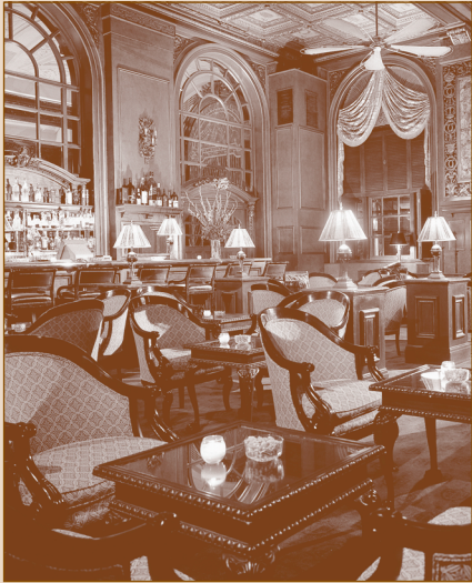
The Oak Bar's history dates back to the repeal of Prohibition.

The Oval Room is such a popular venue that more people have been married there than in neighboring Trinity Church. There was a skating rink under the dance floor where Rudy Valle sang in the 1930s, and skating was arranged as an entertainment for King Saud's harem and children in the 1960s.